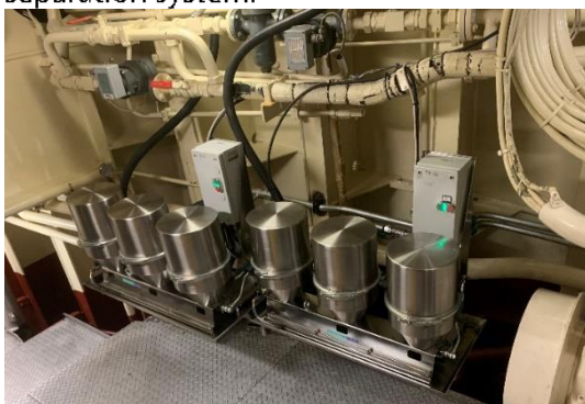
Two pcs. WP1-P2-750 Lubricatin fine filter systems for the two MaK engines