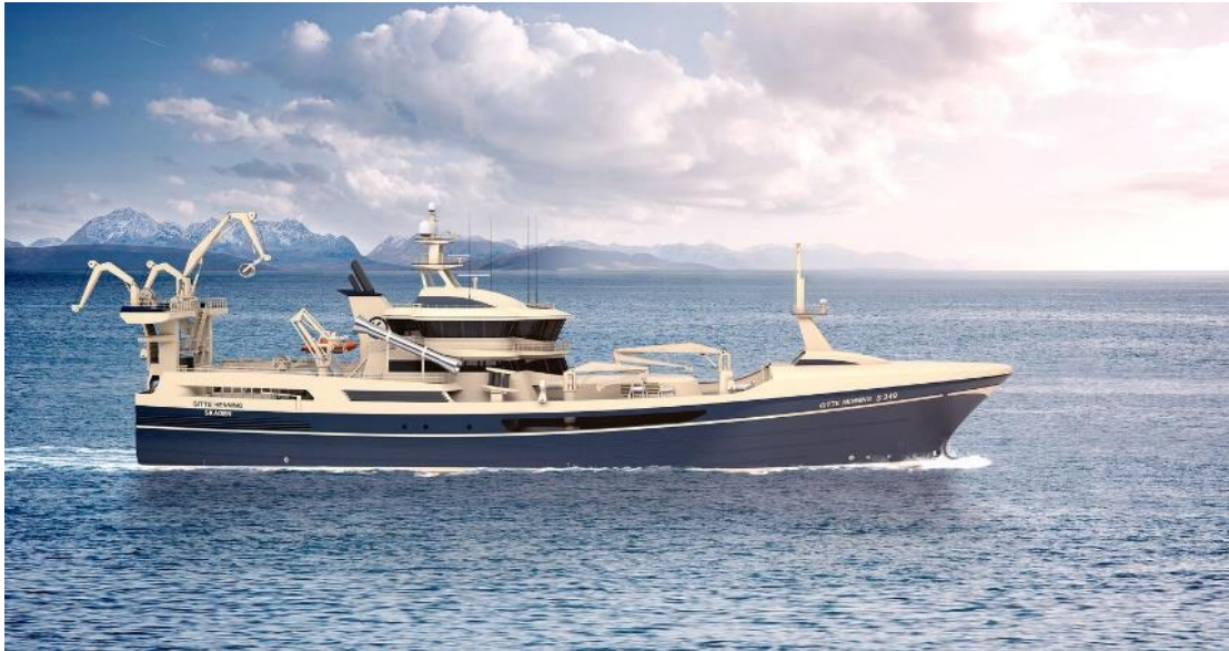
The green newbuilding vessel Gitte Henning 2