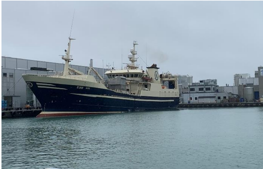
Pelagic trawler - S349 Gitte