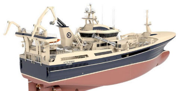
The green newbuilding vessel Gitte Henning 2